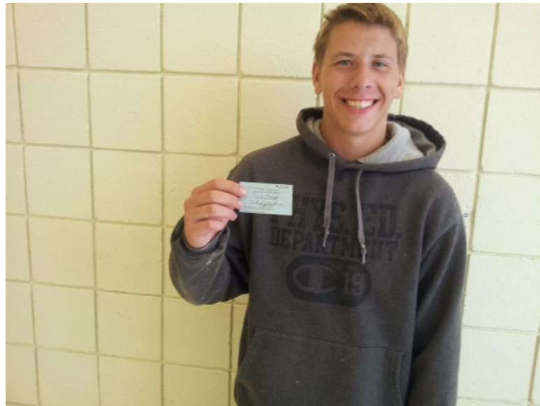
OH NO!!!! Everybody better watch out now.