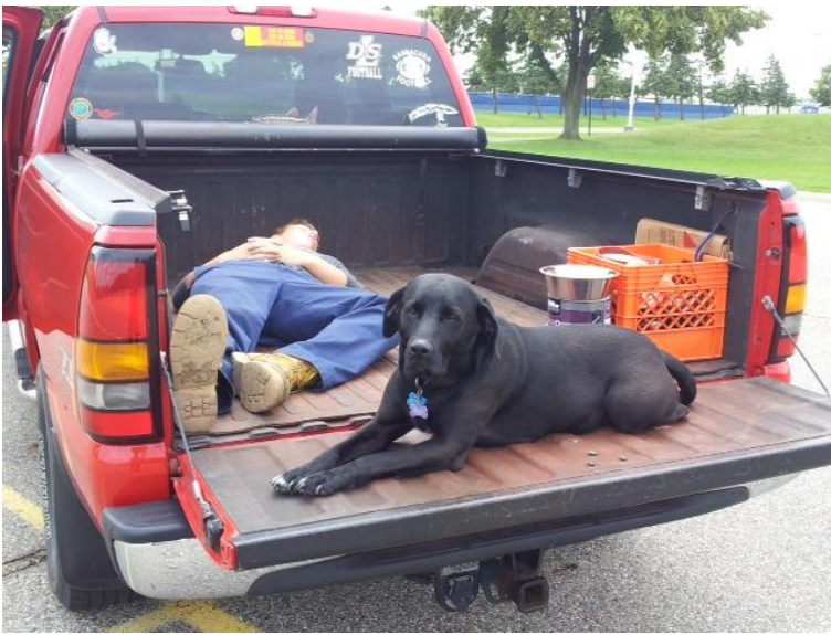
Duke can't believe that Duncan does not want to play!